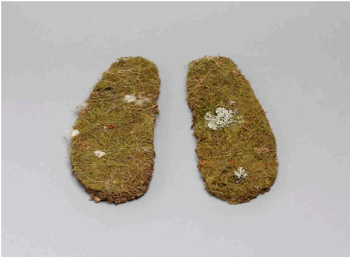
2017 Forest floor 32 x 32 x 4 cm, 12.5 x 12.5 x 1.5 inches, JPML17-2