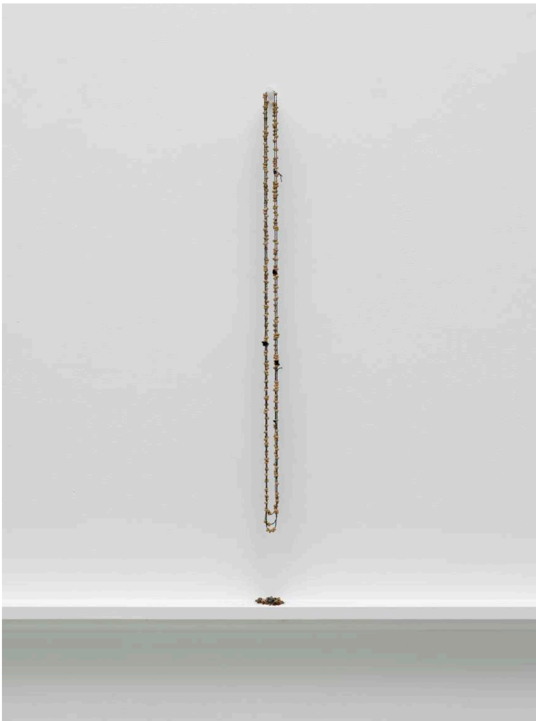
The Following , 2016 Dandelion receptacles, thread, stones and sand 9 x 40 x 30 cm, 3.5 x 15.7 x 11.8 inches