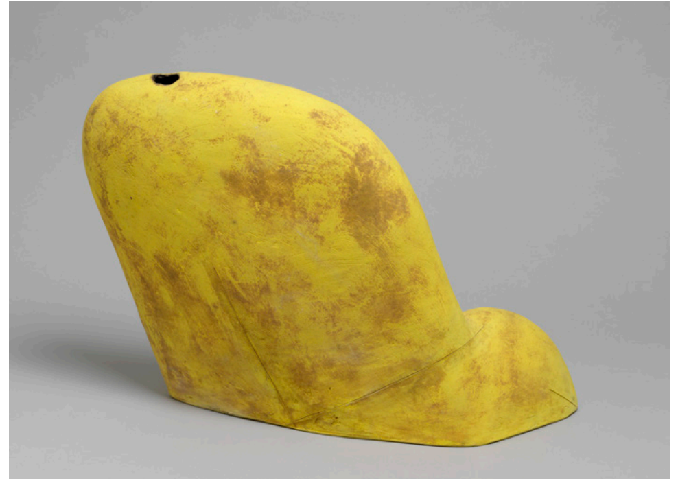
Spring Form 2002 41 x 22 x 52 cm