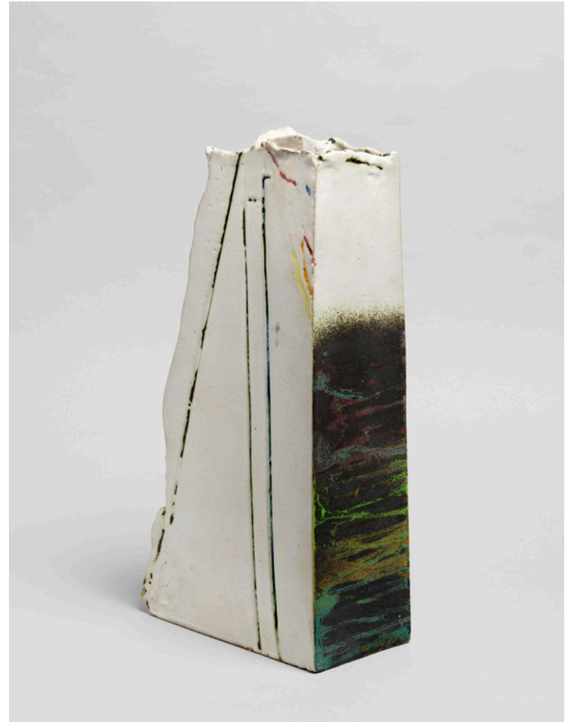
Vessel from the Seferis Series