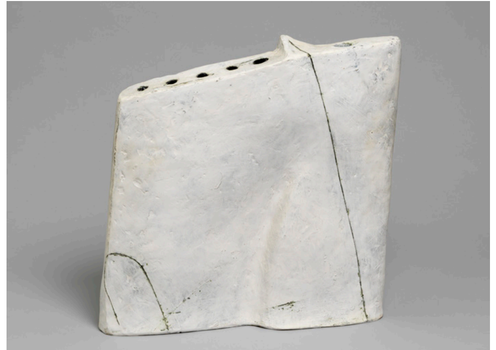
Enigmatic Vessel with Lines and Holes