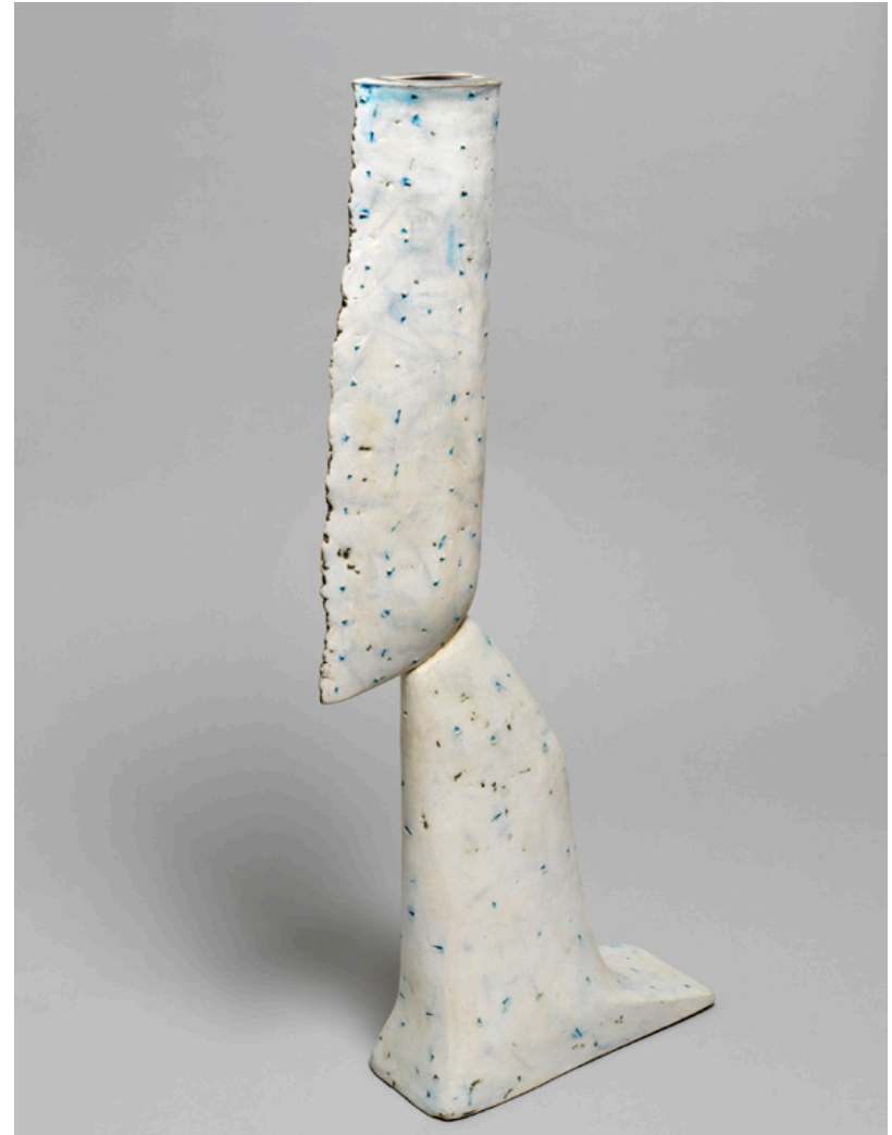
Tall Standing Form