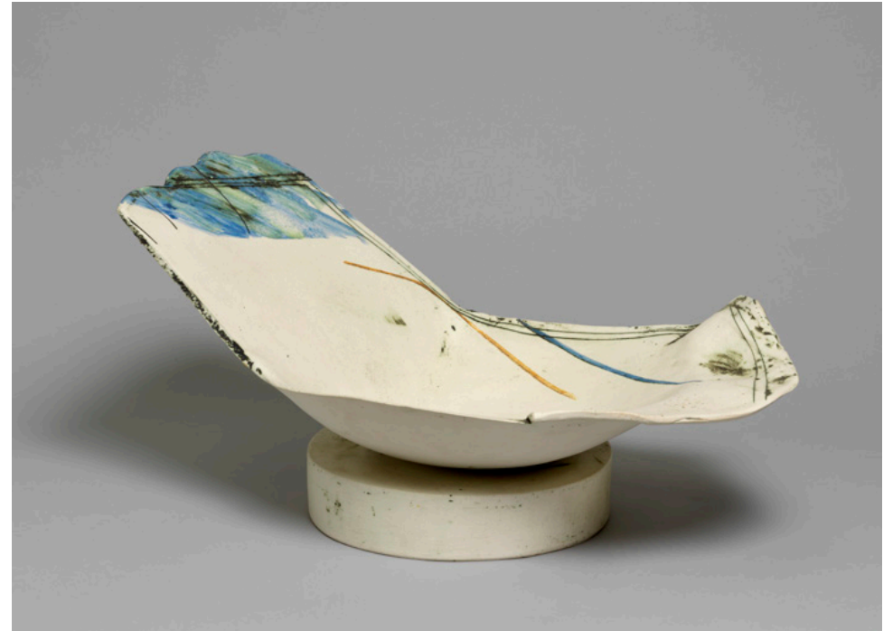
Bowl from the Seferis Series