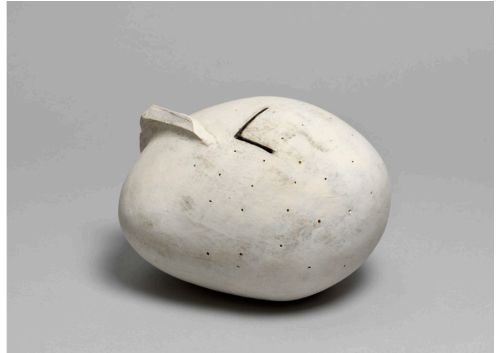
Winged Abstract Vessel