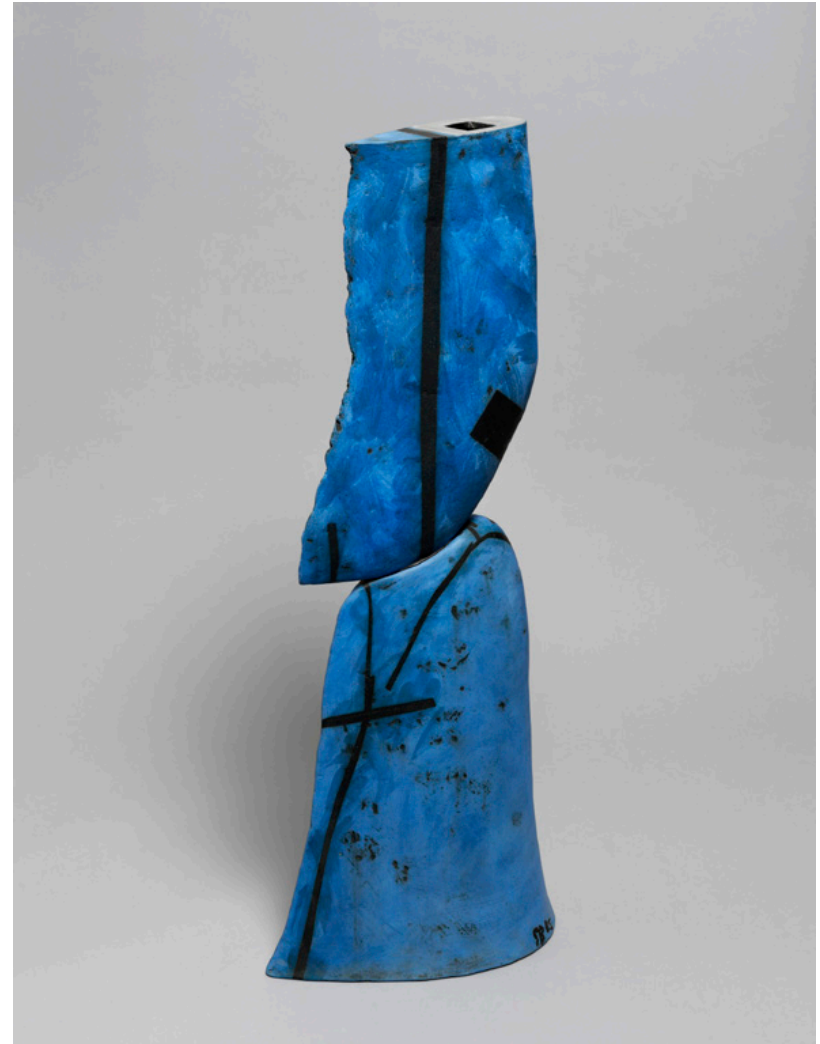
Tall Standing Form