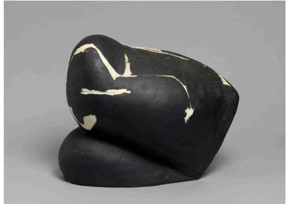
Vessel from the Place of Stones