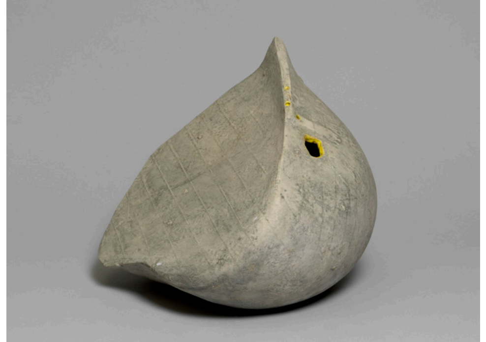
Vessel with Grid