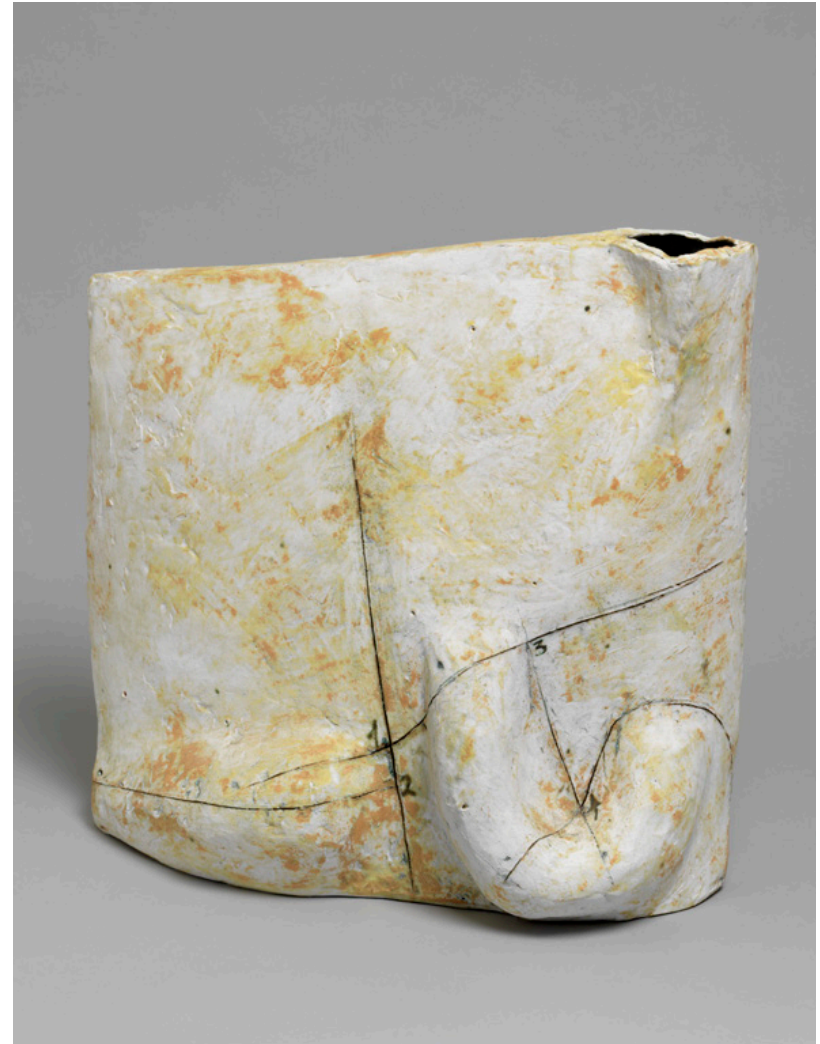
Enigmatic Vessel with Lines and Numbers