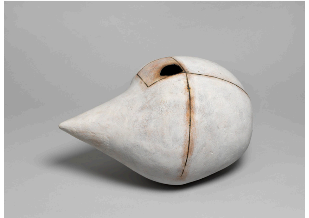
Alembic IV 2002 30 x 55 x 57 cm