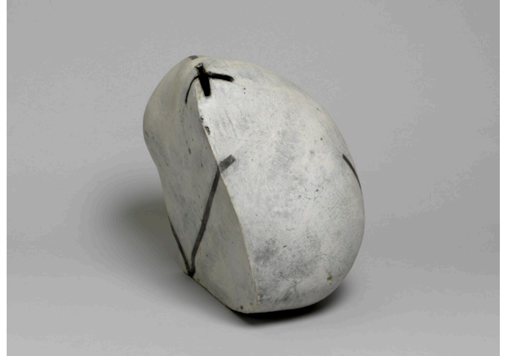
Vessel with a Cross