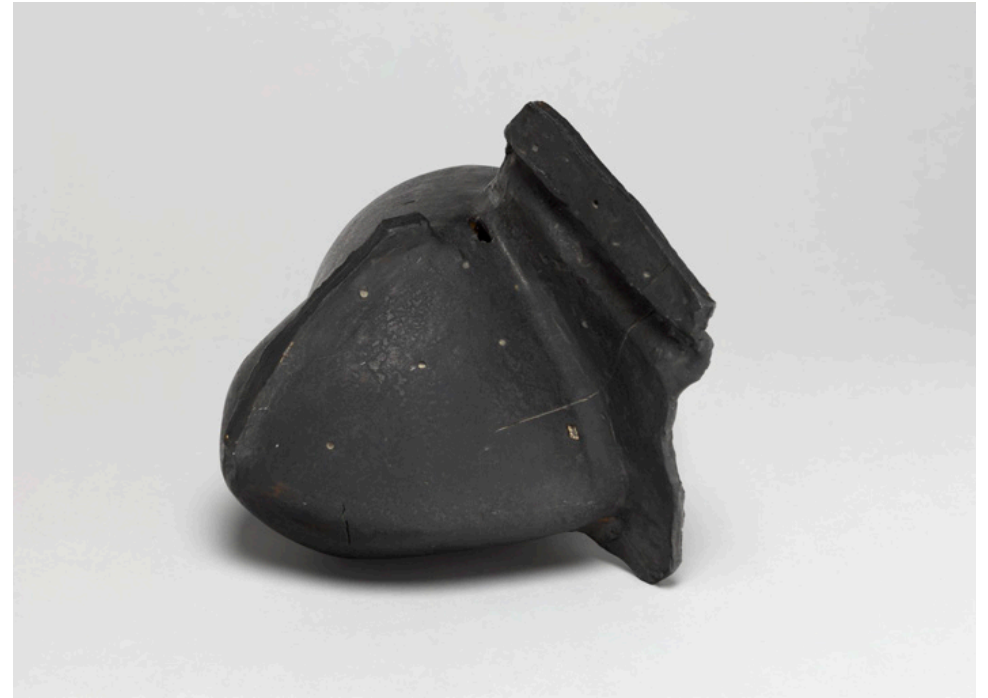
Dark Vessel with Flange