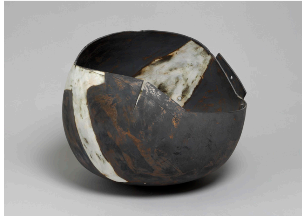
Painting in the Form of a Bowl