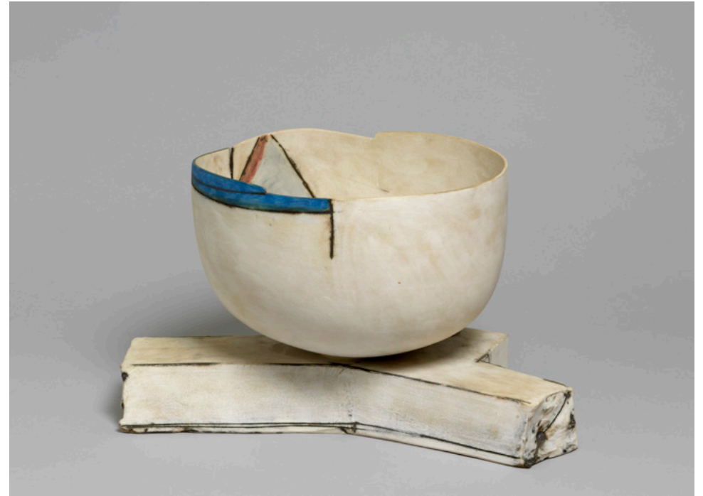
Bowl on a Base