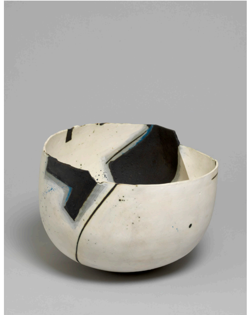
Painting in the Form of a Bowl